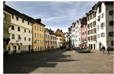
Old town of Chur